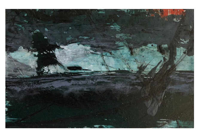
Voyage No. 17, 8x5, acrylic on panel