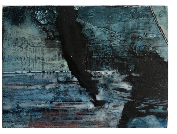
Voyage No. 43, 8x6, acrylic on panel