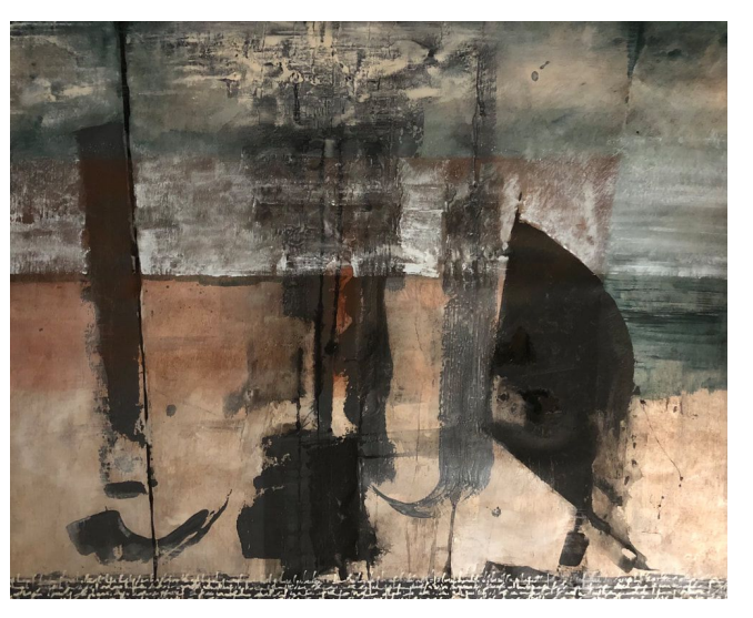
Voyage No. 23, 28x24, acrylic on panel