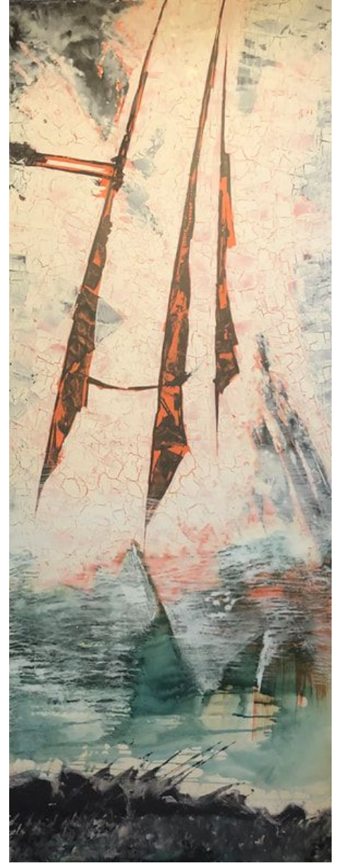
Ghosts, 30x80, acrylic on panel