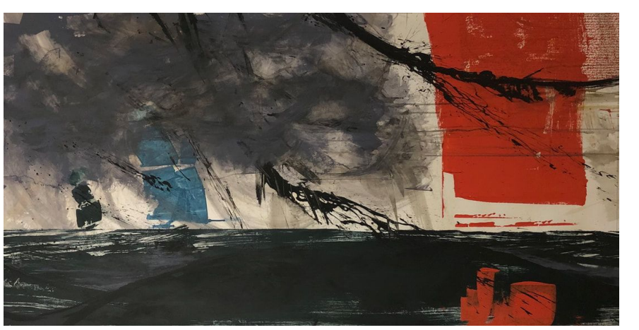
Voyage No. 19 , 54x28, acrylic on canvas